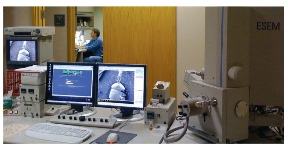
Microscopy suite. The microscope is used by remote classrooms, as well as by Beckman research scientists.

Bugscope hosted its first session in March