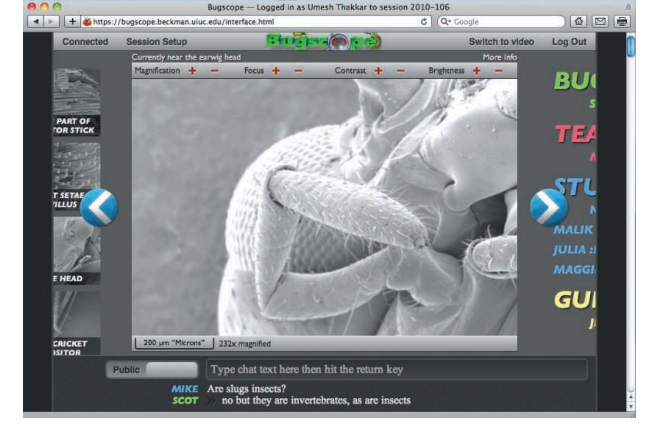
An illustration of live chat interaction. Students take control not only of the microscope but also of posing questions to experts (2010-106 session). Responses are intentionally made accessible for students in different grades.

A standard classroom light microscope allows a magnification of around 1000×. Bugscope, which permits high-resolution imaging at over 20,000×, presents a unique opportunity for classrooms to collect data while discovering and understanding insects. For example, second-grade students from Milwaukee, Wisconsin, after seeing their specimens at a magnification of up to 10,000×, had the chance to "broaden their exposure to deeper understanding of the structures insects possess and perhaps widen their basic understanding of the microscopic world" [p. 31 in (6)] (see the second figure).